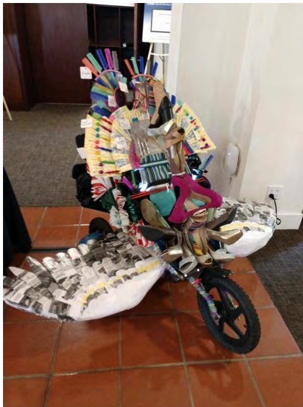
FIGURE 1 The Move Women Project

Matchett created an art installation displayed in the atrium of the Beckman Center during the conference. She sought to make visible all the unique and unspoken norms about women's travel and all the barriers women encounter while traveling with children. Women and their children face safety and security concerns from broken sidewalks, missing curb ramps, inaccessible transit stations, prohibitions against strollers on buses, and worry about exposing children to illnesses. Myriad, often conflicting, expectations challenge women on what is good parenting, while they spend hours chauffeuring their children around in a car. Matchett incorporated a range of these elements that influence mothers' mobility, from a baby stroller to high heels to diaper bags, into her interactive art installation. She attempted to create new knowledge through unconventional ways, inviting WIT participants to write on blank tags additional barriers women face and attach those tags to the installation. Additionally, Matchett used unique materials—old magazine ads with interesting comments about women and cars—in parts of the display.